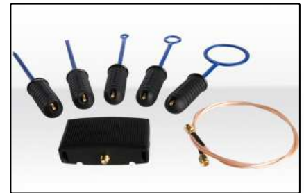
Probe Sets (Page 10)