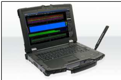
Outdoor Analyzers (Page 4)