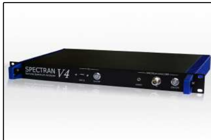
Remote Analyzers (Page 5)