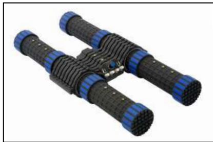
Magnetic Antennas (Page 9)