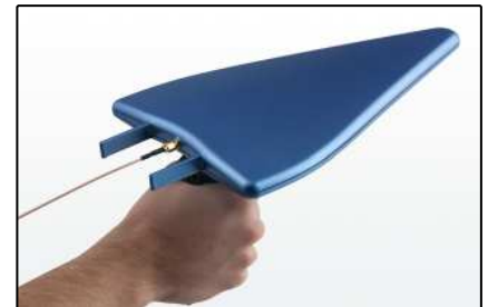
Directional Antennas (passive: Page 6, active: Page 7)