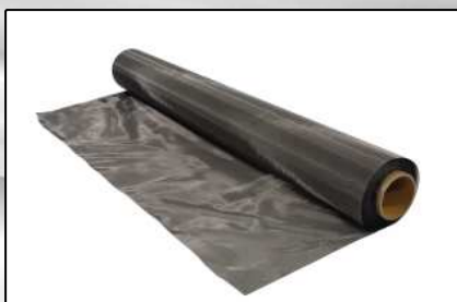
EMC & RF Shielding material (Pages 11-12)