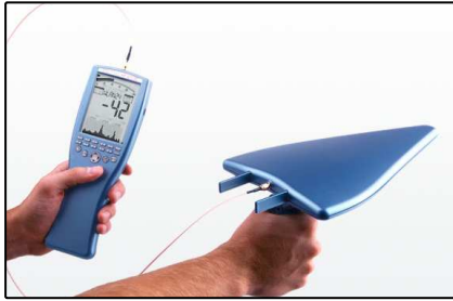
HandHeld Analyzers (Page 2)