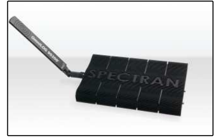
USB Analyzers (Page 4)