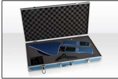
Analyzer Bundles (Page 3)